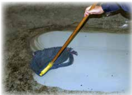
Mop, cloth or brush