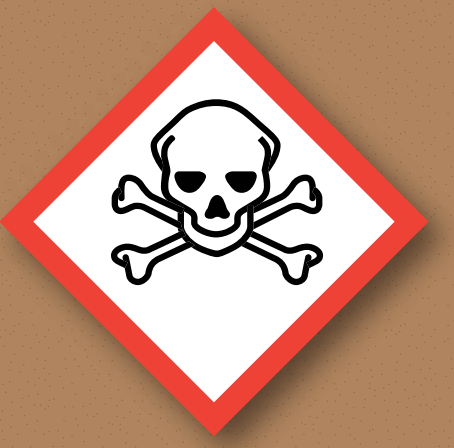
Skull & Crossbones