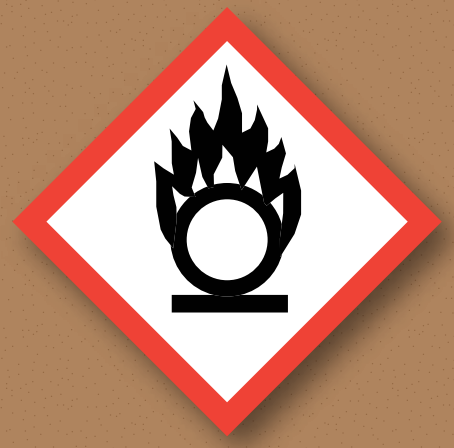
Flame Over Circle