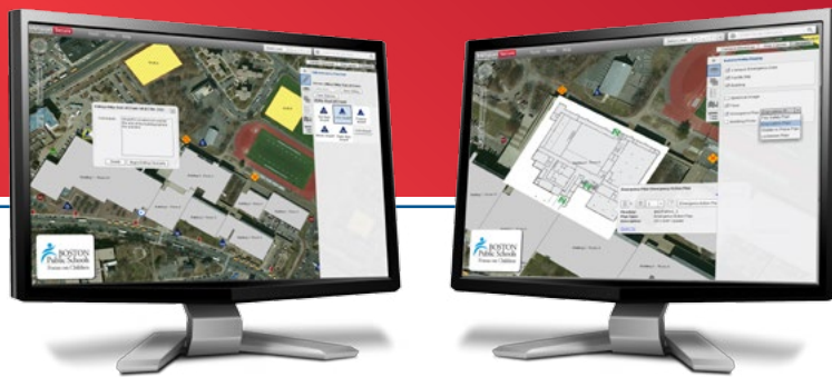
Easily & Securely Place Floor Plans Online and Visualize Emergency Data on a Map