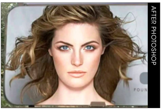
Sometimes gender ideals don't even exist in real life