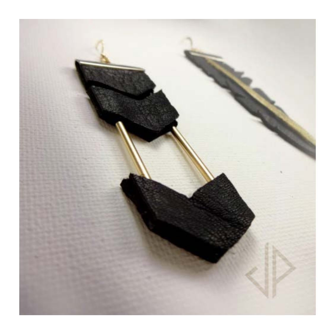
Command. by Joi Price