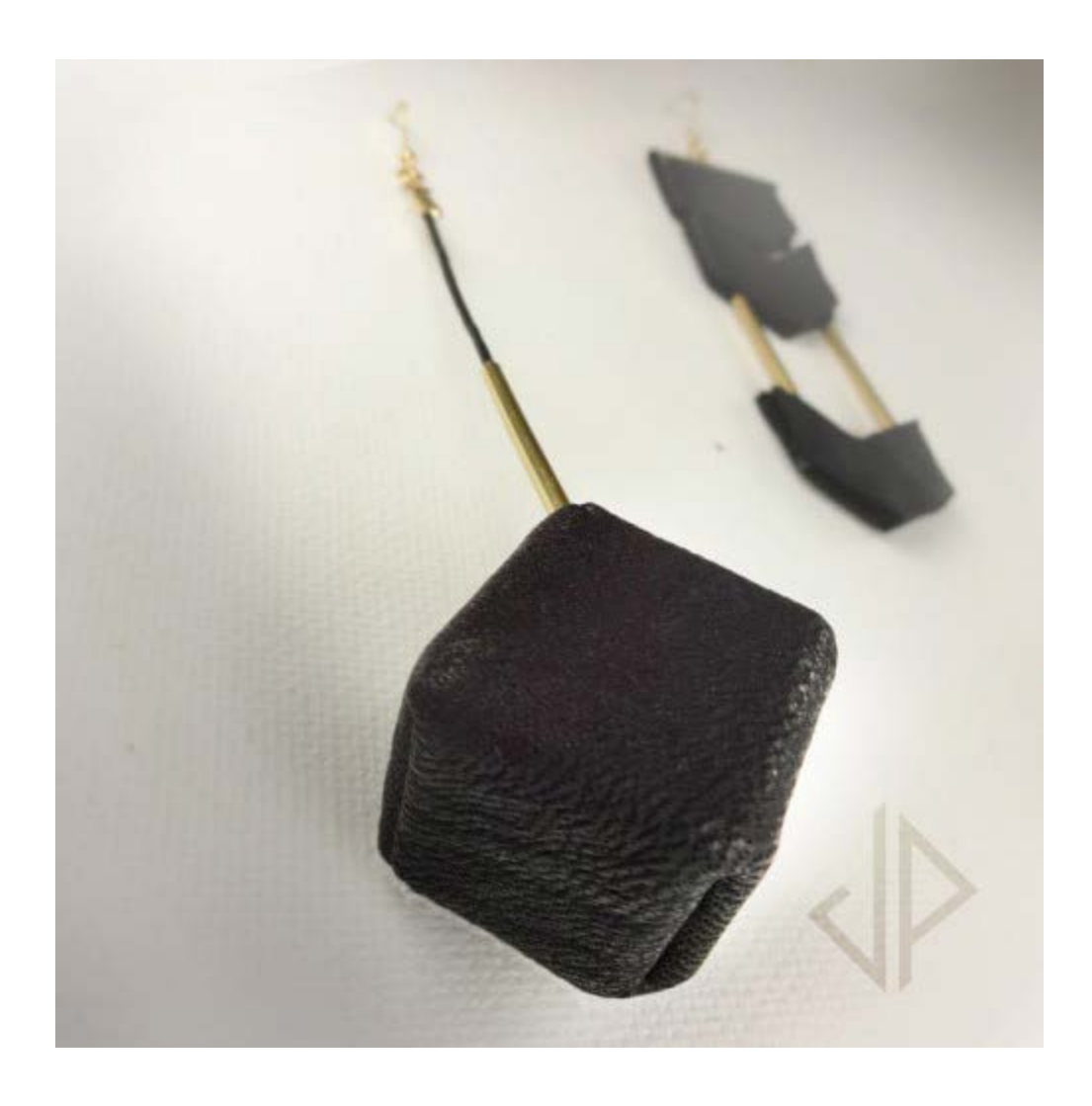
Prim. by Joi Price