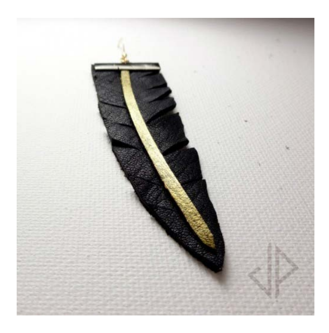
Sariel.