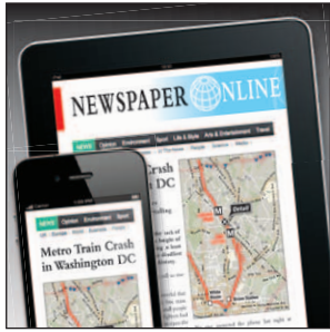
You can now have maps created from scratch in just minutes for your fast-breaking news stories.

Adds impact to your editions on tablet, mobile, print and online.