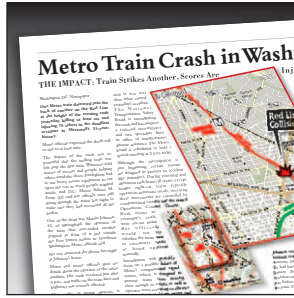
A picture is worth a thousand words, and a content-rich map can communicate the whole story.