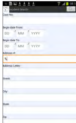
Android smartphones and tablets