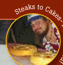
Steaks to Cakes. It's All Good!