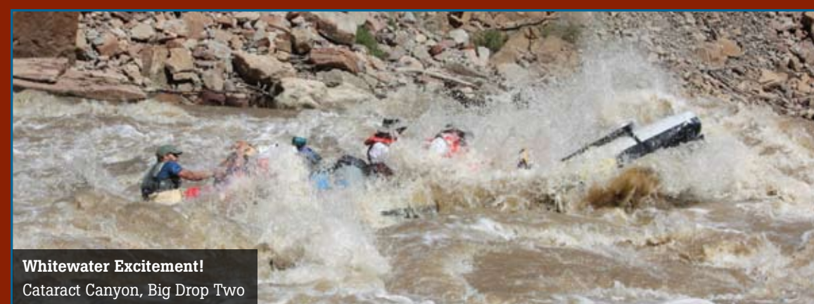
Whitewater Excitement! Cataract Canyon, Big Drop Two

We also run trips on the Alsek and Tatshenshini Rivers in Alaska . A brochure on these wilderness adventures is available on request.