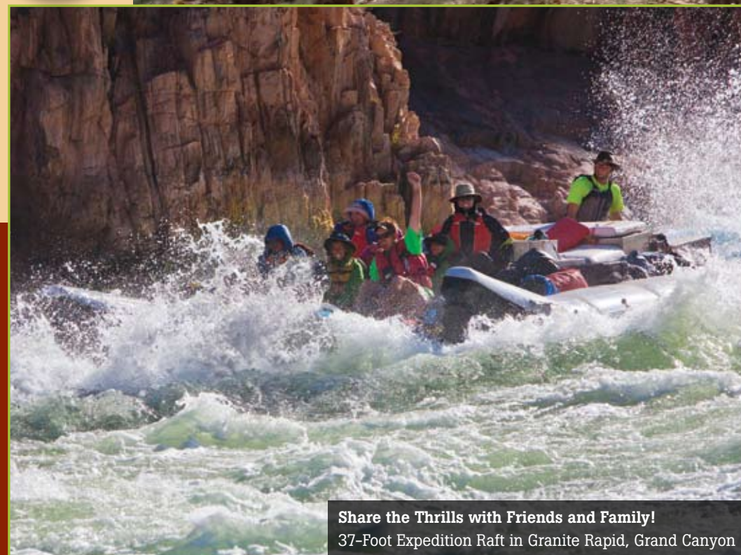
Share the Thrills with Friends and Family! 37-Foot Expedition Raft in Granite Rapid, Grand Canyon

"It was very special to be unplugged with the whole family. . . a wonderful, fun, bonding experience!"