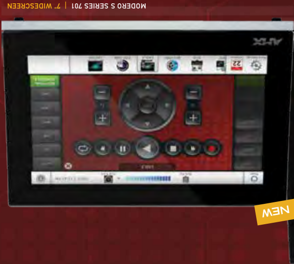
MODERO S SERIES 701 | 7" WIDESCREEN