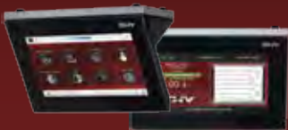
MODERO S SERIES 431

MODERO S SERIES FAMILY ORIENTATION: LANDSCAPE LOCATION: TABLE EXTRAS: M-JPEG STREAMING VIDEO, INTERCOM / VOIP TELEPHONE, TABLET ONLY, USB FOR KEYBOARD & MOUSE, BLUETOOTH FOR AUDIO / KEYBOARD & MOUSE