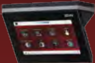
4.3" SECURE TABLE KITS