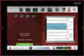
MODERO S SERIES 1001

STREAMING VIDEO, INTERCOM / VOIP TELEPHONE, USB FOR KEYBOARD & KEYBOARD & MOUSE