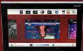
MODERO S SERIES 1001