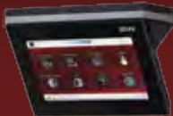
10.1" & 7" SECURE TABLE KITS

**See AMX.com for other 7" Widescreen Modero S Series model dimensions and all metric dimensions **Energy savings is an estimated value based on integration of RMS and Smart Programming