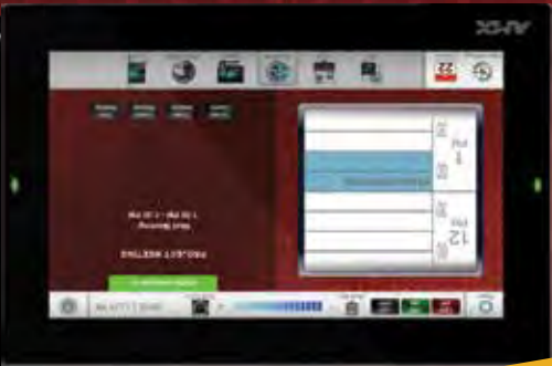
MODERO S SERIES 1001 | 10.1" WIDESCREEN MODERO S SERIES 701 | 7" WIDESCREEN

Is that meeting room available? Who's in there? When will they be done? Can I reserve the room yet? These are all very simple questions that can be surprisingly difficult to answer. Until now. Place a Modero S Series Wall Mount Touch Panel outside every meeting room to view the room schedule at a glance and even reserve it right there at the panel – and get all of this at a price that fits just about any installation budget.