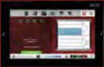
MODERO S SERIES 701