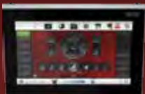
MODERO S SERIES 701