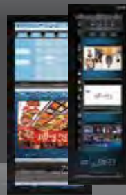
20.3" &amp; 19.4" PANORAMIC WALL