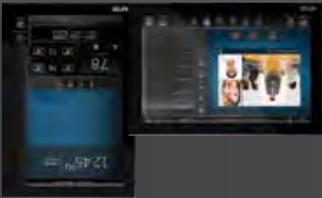
MODERO X SERIES 1001