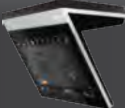
10.1" & 7" SECURE TABLE KITS