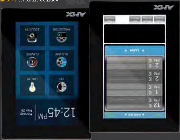
MODERO X SERIES 430 | 4.3" WIDESCREEEN