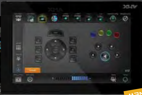
MODERO X SERIES 701 | 7" WIDESCREEN