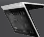
MODERO X SERIES 701