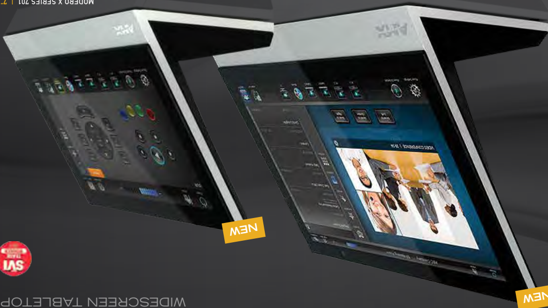
MODERO X SERIES 1001 | 10.1" WIDESCREEN

The 7" and 10.1" Modero X Tabletop Touch Panels offer the same powerful graphics engine, industry leading processor speed and enhanced capabilities of the larger panels. Ideal for a second means of control in large spaces or the primary control interface in smaller spaces, these touch panels round out the Modero X Series Family.