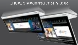
20.3" & 19.4" PANORAMIC TABLE

MULTI-TOUCH, LIGHT/MOTION SENSOR, INTEGRATED CAMERA, SPEAKERS/MIC, BLUETOOTH SUPPORT, NFC-READY COLOR: BLACK