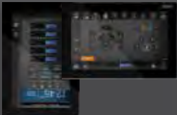
MODERO X SERIES 701

OPTIONS ORIENTATION: PORTRAIT AND LANDSCAPE LOCATION: WALL EXTRAS: MULTI-TOUCH, LIGHT/MOTION SENSOR, INTEGRATED CAMERA, SPEAKERS/MIC, BLUETOOTH SUPPORT, NFC-READY COLOR: BLACK