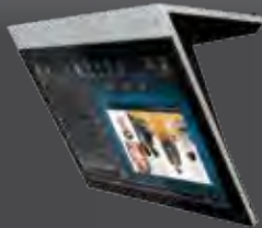
MODERO X SERIES 1001