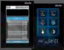
MODERO X SERIES 430