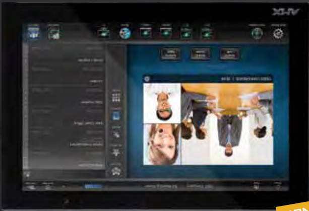
MODERO X SERIES 1001 | 10.1" WIDESCREEN