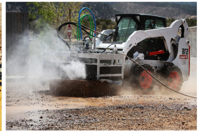
SKID STEER ATTACHMENT