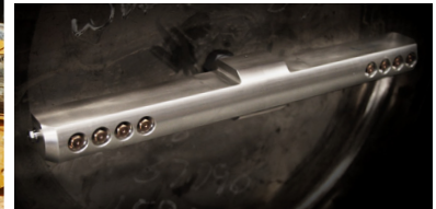
OPTIONAL SCARIFICATION HEAD