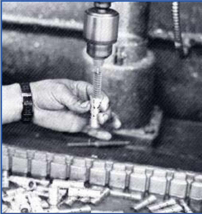
Flexible honing/deburring tool has spring-like action to remove even the smallest burrs left in the predrilled holes.

As a result of using the Flex-Hone tool, a Haskel spokesman says that not only can the company maintain better quality control, but also the cost savings have paid back the system many times over. He estimates that Haskel is now saving 40% of the total cost of producing the part as opposed to jobbing it out.