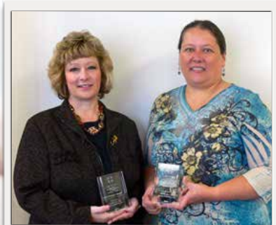
Missouri State Board of Nursing