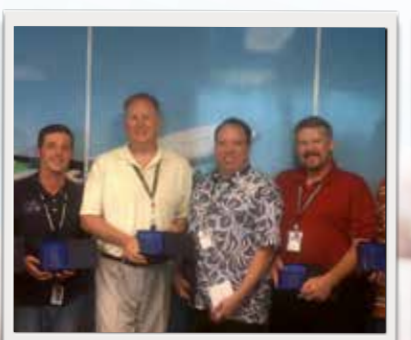
Los Angeles Air Traffic Center