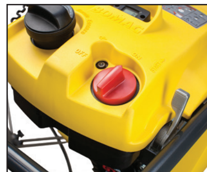
BT60, BT65 - Easy access shut down