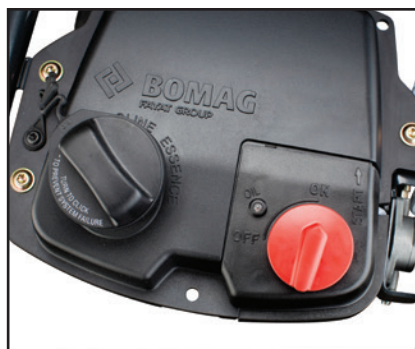
BVT65 - Easy access shut down

Technical modifications reserved. Machine may be shown with options.