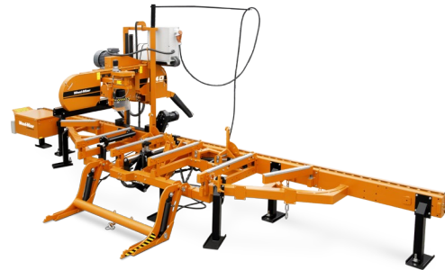
LT40 hydraulic sawmill