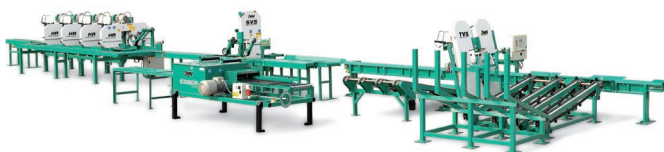
SLP log processing line