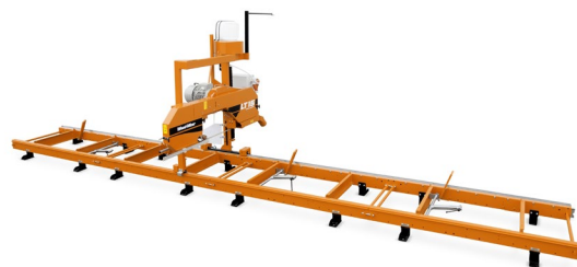
LT15 entry-level sawmill