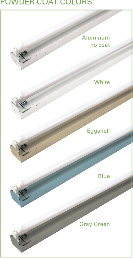
Other colors available upon request