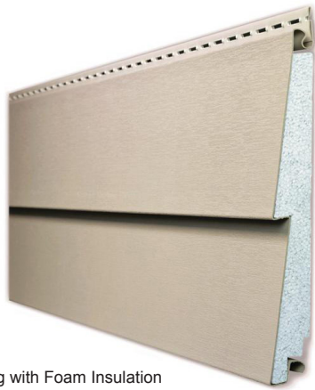
Siding with Foam Insulation