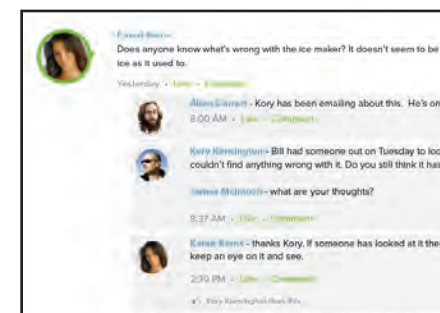
You use Flow just like other social media websites. You write posts, comment and like. You can even attach files and links.