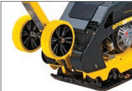
The transport wheels allow for one-person movement around the jobsite.