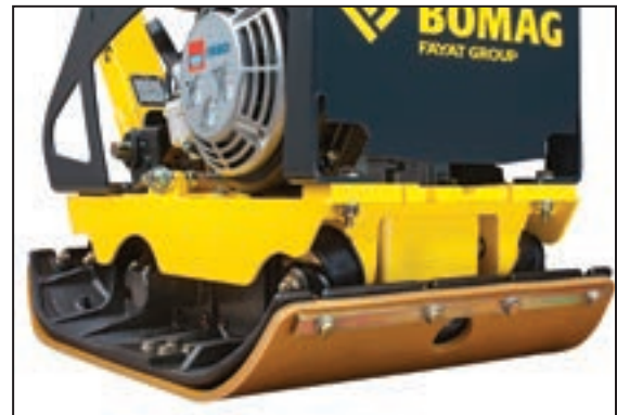
The Vulcolan mat helps avoid damage to paving stone surfaces.