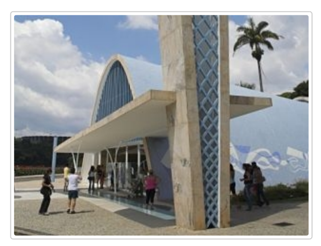
Day 2 TRAIN FROM VITORIA TO BELO HORIZONTE

After breakfast, transfer to the train station for the ride from Vitoria to Belo Horizonte, riding in executive class. Once you arrive in Belo Horizonte, check in to the hotel and relax for the rest of the day.