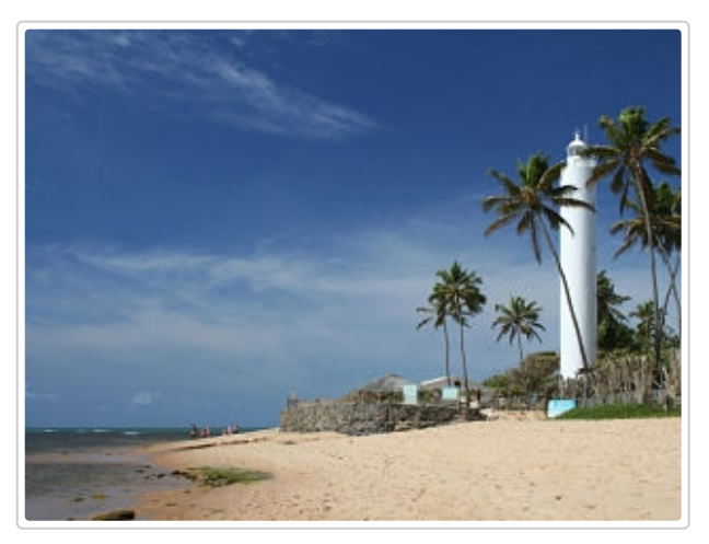
Day 13 SALVADOR HISTORIC TOUR

After breakfast, explore historic Salvador, including the Pelourinho neighborhood. This 6 hour guided tour also includes lunch. Pelourinho was described by UNESCO as the most important collection of baroque colonial architecture in the Americas and has been recently restored to its sixteenth, seventeenth, and eighteenth century splendor. It retains a traditional atmosphere rarely found in old cities, because in Bahia, tradition lives on, intermingling with its present. Visit the House of Jorge Amado Foundation, the City Museum, the Udo Knopf Museum, and the gilded São Francisco Church.