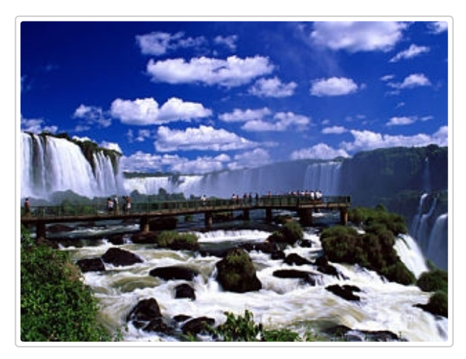
Day 10 ARRIVE IN FOZ DO IGUASSU & TOUR OF THE FALLS

After breakfast in the hotel, transfer to the airport for the flight to Foz do Iguassu, Brazil's closest city to the Iguassu Falls. After you check in to your hotel and rest for a little while, your guide will take you on an afternoon tour of the Brazilian side of the Iguassu Waterfalls. This impressive set of waterfalls forms the border between Argentina and Brazil, and from the Brazilian side, you can walk out over catwalks and above the falls as well. There are also walking trails surrounding the falls.