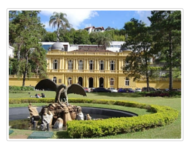
Day 6 SÃO JOÃO DEL REY TO PETROPOLIS TO RIO DE JANEIRO

Transfer today from Ouro Preto to Tiradentes, with a stop at the UNESCO World Heritage Site, the Sanctuary of Bom Jesus do Congonhas. Then travel from Tiradentes to Sao Joao Del Rey aboard a steam train. Spend the night in Tiradentes, in a pousada near the central square.