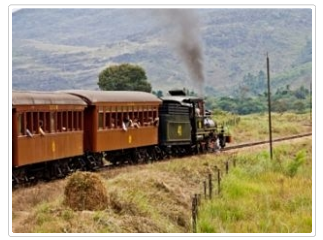
Day 4 STEAM TRAIN OURO PRETO TO MARIANA

Breakfast in your hotel in Belo Horizonte. Transfer Belo Horizonte to Ouro Preto by car, van or bus (Belo Horizonte - Ouro Preto: 104 km). Once in Ouro Preto, check in to the pousada and relax. Ouro Preto, which means "Black Gold" in Portuguese, was at the heart of Brazil's 17th century gold rush. Gold from this region was sent overland to Paraty, where it was then shipped to the Old World, and financed Europe's Industrial Revolution. During the 1800s, Ouro Preto was one of Brazil's wealthiest cities.