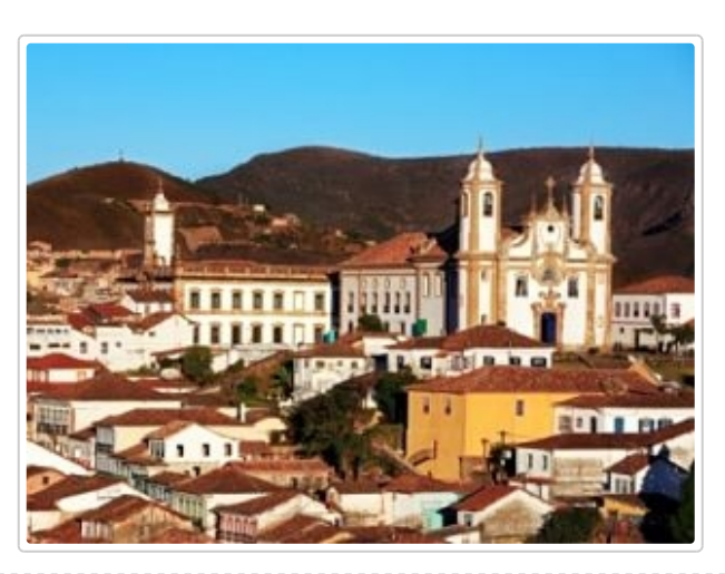
Day 3 ARRIVE IN OURO PRETO

After breakfast, transfer to the train station for the ride from Vitoria to Belo Horizonte, riding in executive class. Once you arrive in Belo Horizonte, check in to the hotel and relax for the rest of the day.