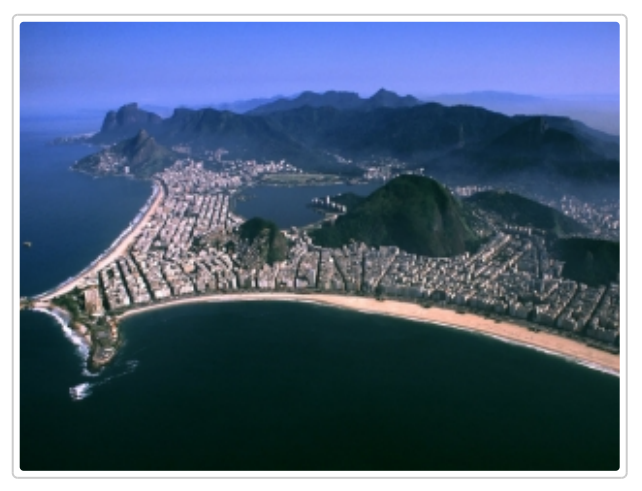
Day 7 RIO DE JANEIRO CITY TOUR

Breakfast in the Pousada. Transfer from São João Del Rey to Petropolis. In Petropolis, visit the Imperial Museum. From Petropolis, transfer to the nearby "Marvelous City" of Rio de Janeiro. Check into one of the high-quality hotels on Copacabana Beach.