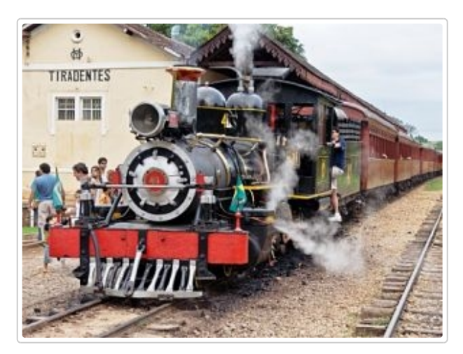
Day 5 TIRADENTES & SÃO JOÃO DEL REY

Transfer today from Ouro Preto to Tiradentes, with a stop at the UNESCO World Heritage Site, the Sanctuary of Bom Jesus do Congonhas. Then travel from Tiradentes to Sao Joao Del Rey aboard a steam train. Spend the night in Tiradentes, in a pousada near the central square.