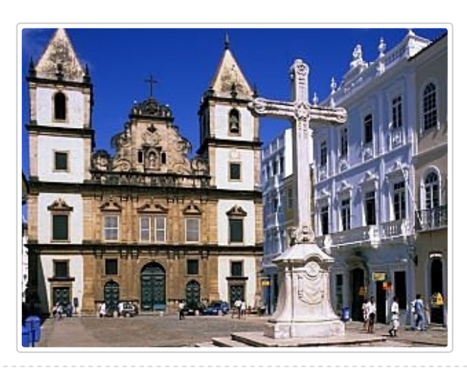
Day 12 ARRIVE IN SALVADOR BAHIA

After a short drive and a quick customs check, cross the bridge over the Iguassu River, which forms the border between Argentina and Brazil. Once in Argentina, follow a scenic highway up to the Argentine Iguazu Park. The tour starts with ample time to visit the upper Argentine falls, including the San Martin Falls and the Devil's Throat. On the way back from the falls, stop at the Argentine shopping district, and if weather and time allows, a brief stop at the 3 Borders point, where the Paraná and Iguassu Rivers as well as the borders or Brazil, Argentina and Paraguay intersect. Also visit the Itaipu Dam, one of the world's largest hydroelectric dams, stretching across the Parana River from Paraguy to Brazil, with a huge generating capacity. Return to your hotel in Foz do Iguassu in the late afternoon.