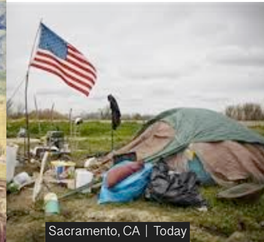
Sacramento, CA | Today

A documentary film exploring the legacy of John Steinbeck's American realist novel The Grapes of Wrath while revealing the struggles of dispossessed families in the U.S. today.