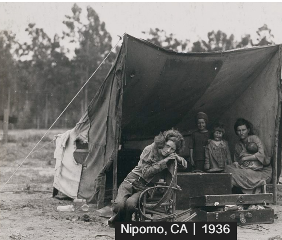
Nipomo, CA | 1936