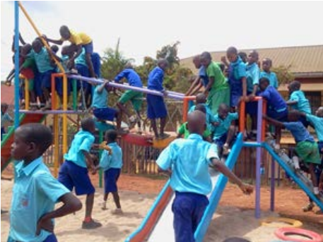
Installed a play structure on the school grounds.