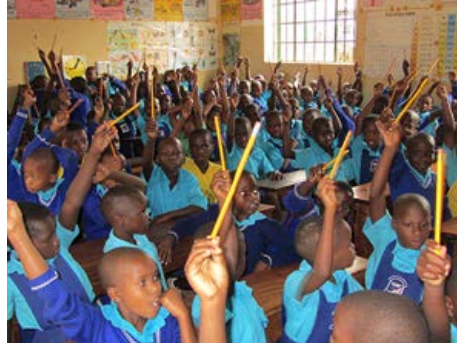
Installed classroom partitions to allow for more teaching space and thus reduce overcrowding. Established uniform program to clothe every student in attendance.