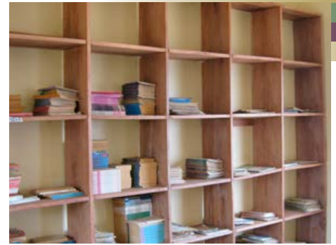
Refurbished library facilities with shelving and storage fixtures