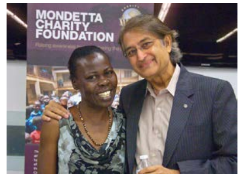
Teacher exchanges with teachers from both Kampala and Winnipeg visiting the other to exchange ideas on teaching methodology and sharing goodwill thus further fostering the relationship established between the school in Uganda and the Seven Oaks School Division here in Winnipeg.