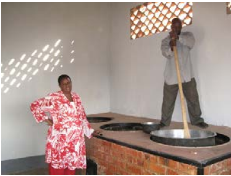
MCF established a daily meal program, which necessitated the renovation of the existing kitchen facilities. To date, over 1.5 million meals have been served which, for many of the children there, is often times the only meal they will receive all day.