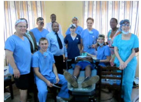
Partnering with local dentists, their staff and families, a Dental Mission to provide basic treatment took place in 2012 which witnessed over 450 students receiving treatment who most likely would never have had the chance to visit a dentist.