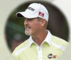
Jerry Kelly PGA Tour Pro