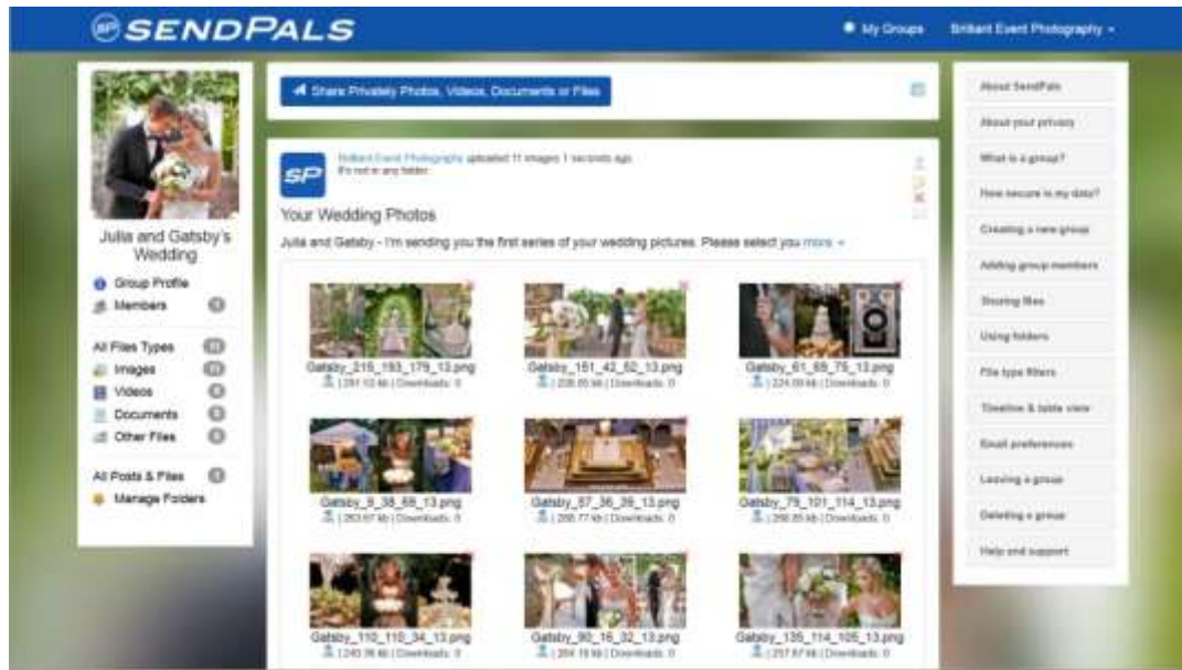
Inside a SendPals Group