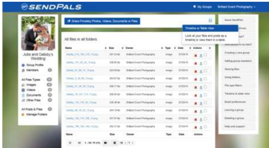
File management view

SendPals allows you to toggle between viewing your files in "Social Networking" view or "File Management" view. Table view shows you just the files and their attributes which is great for traditional file management. Timeline view tells the "story" of who shared which files at what points in time and what was the message that went along with the files.