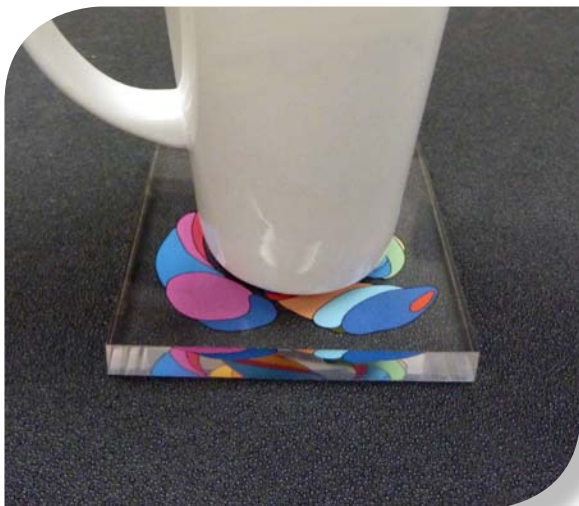
With opaque white ink backing, these coasters can be placed on any color surface and still maintain clear visibility.