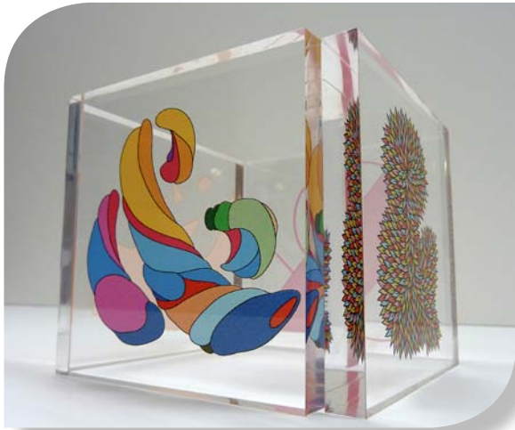
Crystal clear acrylic coasters, 4 coasters per set.