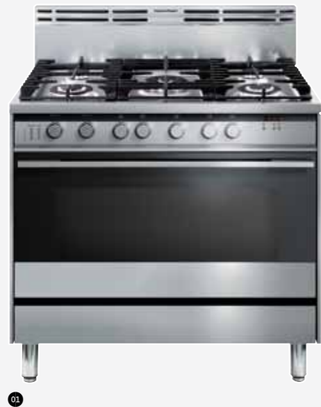
① OR36SDBGX2 36" Gas Range H35 7/16" - 37 1/2" x W35 1/8" x D23 1/2"