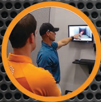
Golf Swing Video Analysis