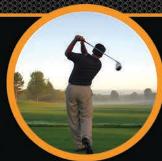
Stay & Play Retreats

GOLF-SPECIFIC • PRO TOUR PROVEN • JOEYDGOLF.COM