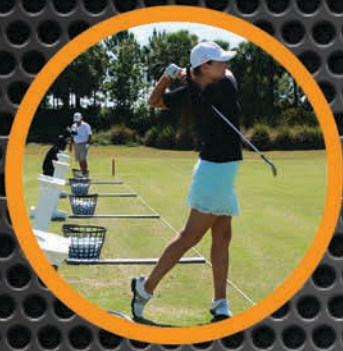
Game Day Performance Tips