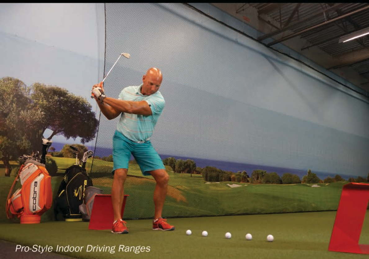
Pro-Style Indoor Driving Ranges