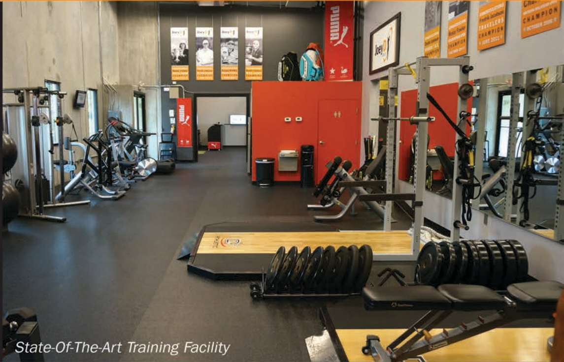
State-Of-The-Art Training Facility