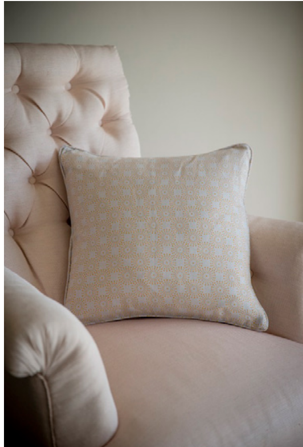
Cushion, Mustard Dot, £45