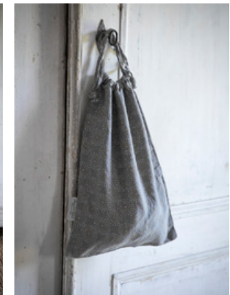
Shoe Bag, Charcoal with Mustard Dot, £17.50