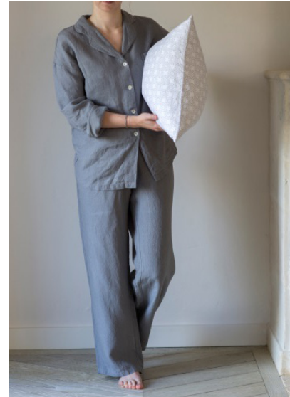
Pyjamas, Duck Egg and Charcoal, £120