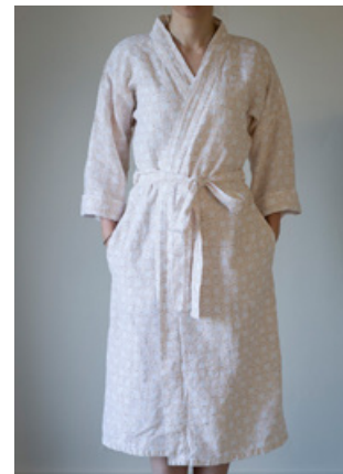
Bathrobes, Charcoal and Mustard Dot, £197.50