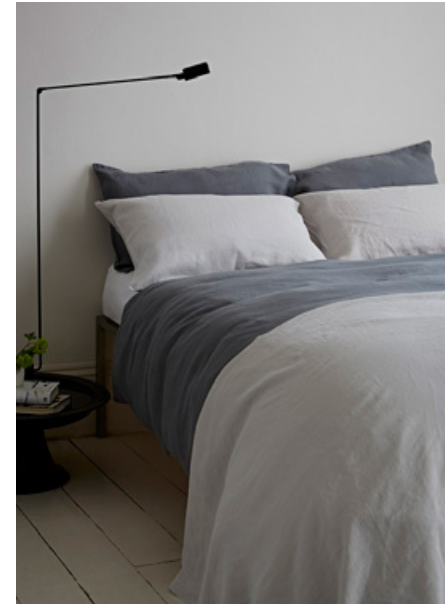
Charcoal Bedlinen, from £30, shown here with Dove Grey