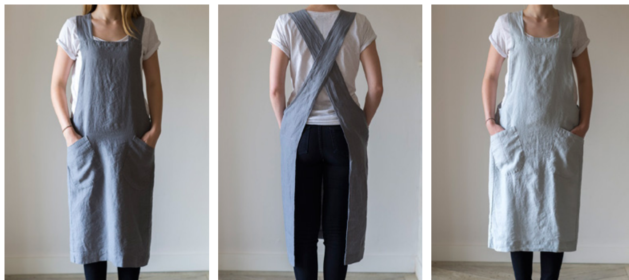
Artisan Pinny, Duck Egg or Charcoal

Dot print Tea Towels in 6 colourways make an interesting addition to the Kitchen range. These can be bought in sets of two for an original Christmas gift.