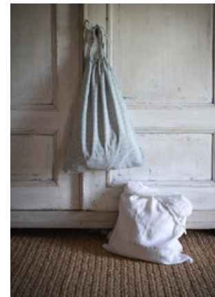
Laundry Bags, Duck Egg Dot, £36.50, White with LAUNDRY Stamp, £28