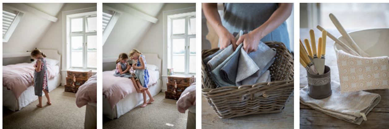
Artisan Pinny for Child (age 5-8 years), Charcoal or Duck Egg