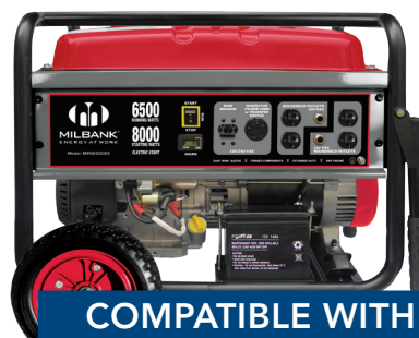
Milbank 6500 watt portable generator

*See back of flyer for features included in each package.