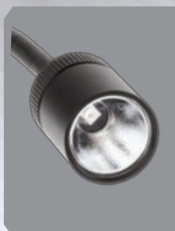
High-efficiency deep parabolic reflector