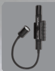
Magnetic base (MTU-136)