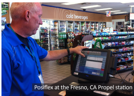
Posiflex at the Fresno, CA Propel station

Traditionally, two terminals were required for combination fueling and convenience store operations: one at the fuel pump and one in the store. Triple E expanded toolbar functionality to a full-screen touch application on Posiflex terminals, integrating fuel site controller and POS register functions into one intuitive application to support all station services. The configuration used at Propel is the Vanguard Pro FCT paired with a Navigator site controller. Triple E's modular suite of software and hardware products work together as an integrated, customizable, stand-alone solution to meet virtually any POS business need.