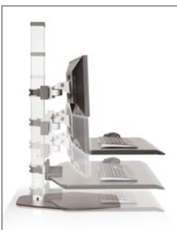
Seamless height adjustment