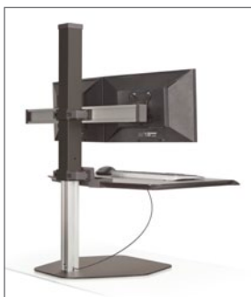
Engineered for stability