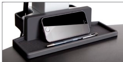
Expansive work surface features a storage tray —keeps items within reach