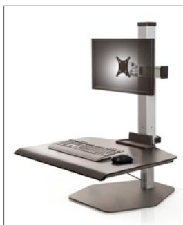
Single monitor option available