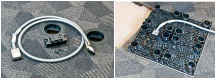
UL Approved power cables and outlets are snapped together and placed on the floor. The outlets get snapped into place and cable is buried under the floor. If an outlet location needs to be changed, simply lift the outlet up, move it, and bury the cable back into the floor. No special tools required. No special labor required. Nothing wasted.

When the cable is laid out on the floor, it is easy to visualize the circuit plan and make it look like the installation wiring diagram.