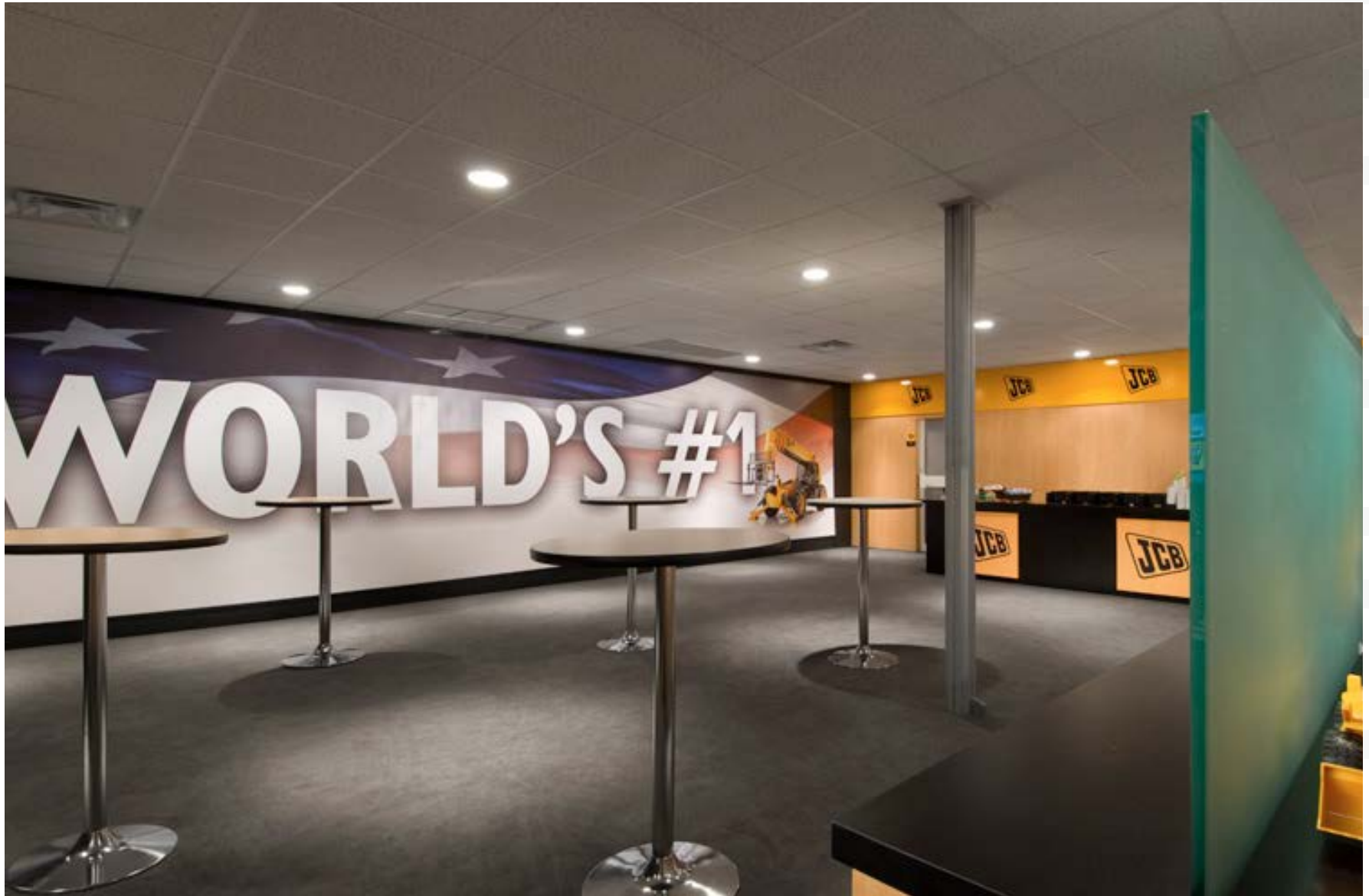
Custom Drop Ceiling and Recessed Lighting