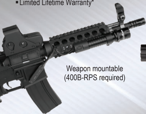
Weapon mountable (400B-RPS required)