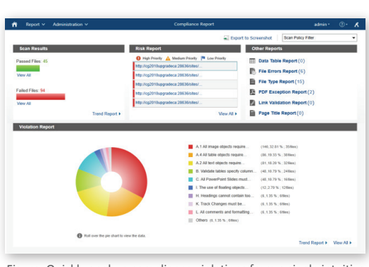
Figure: Quickly analyze compliance violations from a single intuitive graphical dashboard.

Prove It. Prove policy compliance with ongoing monitoring, detailed reporting, and granular incident tracking. Produce detailed reports of both preventative and corrective actions taken to ensure content is uploaded, stored, classified, and secured in accordance with your information governance policies. You'll be able to confidently report on risk levels at any point in time, as well demonstrate to chief security personnel progress in reducing overall organizational risk.