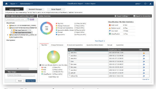
Figure: Take a range of comprehensive actions to ensure compliance with information governance policies.