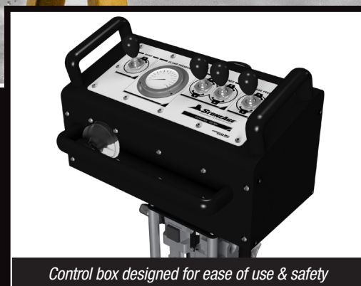
Control box designed for ease of use & safety