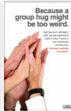
Go Live & Beyond