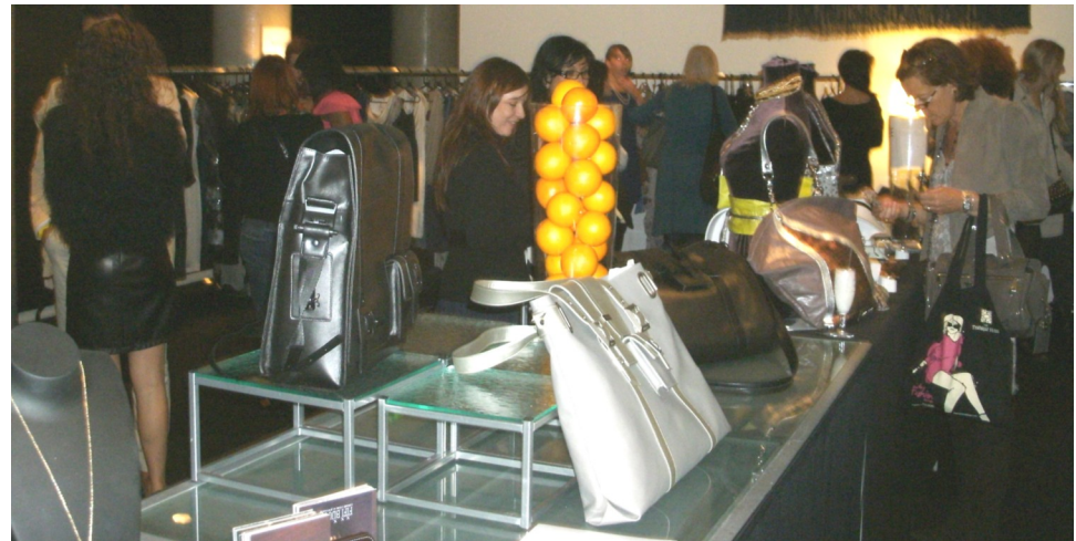
Fashion Lounge London Fashion Week Trafalgar Hotel