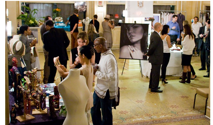
Ethical Fashion Preview New York Fashion Week

The showrooms focus on marketing, sales and promotional solutions for lifestyle companies that are effective in the quickly evolving global market. The out-of-the-box approach helps designers capture the attention of an ever-changing audience, creatively incorporating social media and digital techniques in marketing campaigns and promotions.