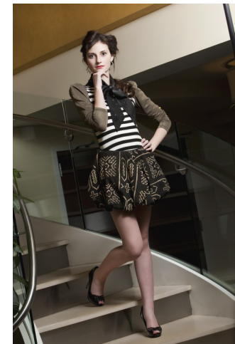
New York Style-Off Competition