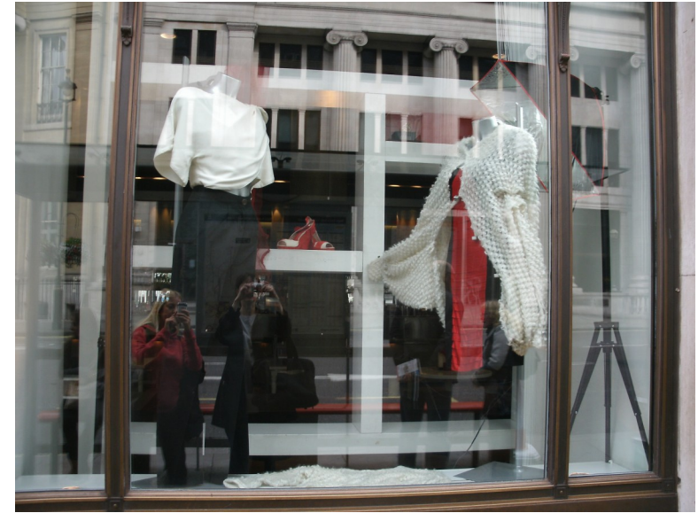
London Fashion Week Window Display Trafalgar Hotel

Linger magazine | Eco Fashion World | Runway magazine