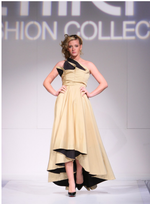
Ethical Fashion Collective Runway Show New York Fashion Week

The showrooms focus on marketing, sales and promotional solutions for lifestyle companies that are effective in the quickly evolving global market. The out-of-the-box approach helps designers capture the attention of an ever-changing audience, creatively incorporating social media and digital techniques in marketing campaigns and promotions.