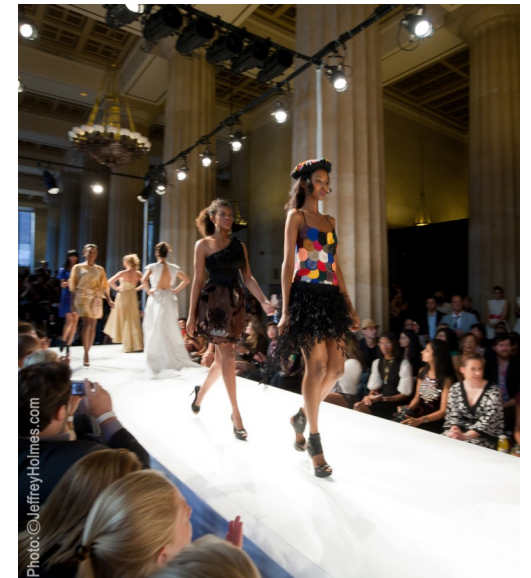
Ethical Fashion Collective Runway Show New York Fashion Week