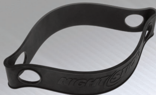
Heavy-Duty Silicone Rubber