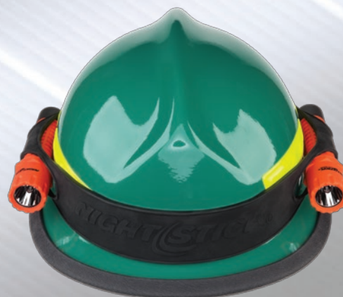
Dual hole design