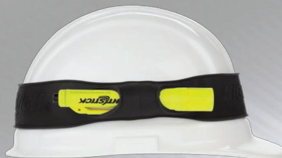
Fits any light up to 1.25" in diameter

*Limited 1 Year Warranty Product is warranted to be free from defects in workmanship and materials to the original purchaser for one (1) year from the date of purchase, and includes the LEDs, housing, lenses, electronics, switches, rechargeable batteries and chargers. Disposable non-rechargeable batteries are excluded from this warranty. Normal wear and failures which are caused by accidents, misuse, abuse, faulty installation and lightning damage are also excluded.