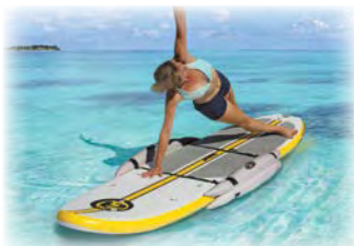
AHSUP-A006 SUP TRAINING WHEELS $49.99 Retail