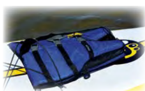
AHSUP-A020 DELUXE COAST GUARD KIT 34.99 Retail