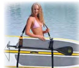
AHSUP-A016, SUP CARRIER $21.99 Retail