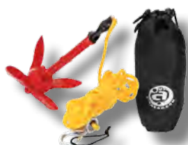
AHSUP-A015 FOLDING ANCHOR 29.99 Retail