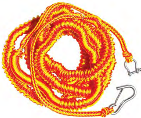
AHAB-1 ANCHOR BUNGEE

AIRHEAD Anchor Bungee enables you to tether your boat offshore, away from a beach or rocky shoreline without having to swim or use a dinghy! Connect an anchor to your boat with the high tensile strength Anchor Bungee and set the anchor offshore. A heavy duty zinc plated shackle and snap hook are provided for attaching the Anchor Bungee to your anchor and boat. Tie a line to the stern to pull the boat into the shore to unload your group. Simply secure the end of the rope to a stake onshore and release the rope; Anchor Bungee will pull the boat away from shore into safe waters! Anchor Bungee flexes to relieve stress on the anchor, increasing its holding power. The bright red and yellow 16 strand 2500 lb. tensile strength rope is easy to spot and is constructed of polypropylene so it floats. Use it once and you'll wonder how you ever lived without one!