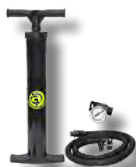
AHSUP-023 HIGH PRESSURE HAND PUMP 35.99 Retail