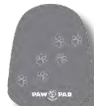
AHSUP-A011 PAWS PAD $29.99 Retail