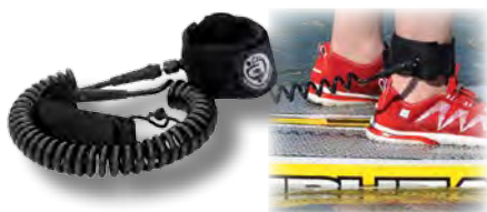
AHSUP-A007 HEAVY DUTY LEASH $29.99 Retail