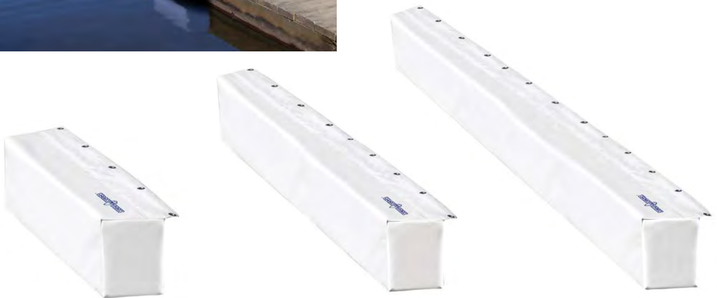
HHB-36: 36" x 8" x 6"