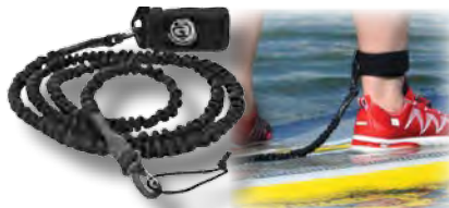
AHSUP-A008 SCRUNCHY LEASH $19.99 Retail