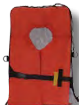
AHSUP-021 BASIC COAST GUARD KIT 24.99 Retail