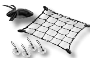
AHSUP-A024 SUP BUNGEE CARGO NET $19.99 Retail