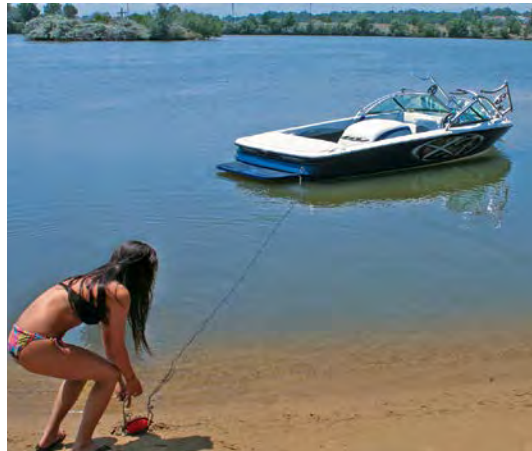
AHAB-2 ANCHOR BUNGEE LITE