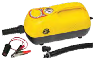
AHSUP-A022 SUPER HIGH PRESSURE AIR PUMP 12V 159.99 Retail