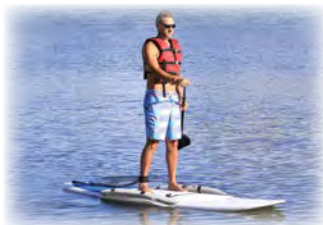
AHSUP-A005 SUP STABILIZERS $89.99 Retail

Kwik Tek introduces an entire new line of AIRHEAD SUP® ACCESSORIES for the 2015 season. Visit WWW.AIRHEADSUP.COM to see more details on our new SUP Collection!