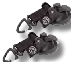
AHSUP-A010 SUCTION CUP TIE DOWNS 15.99 Retail