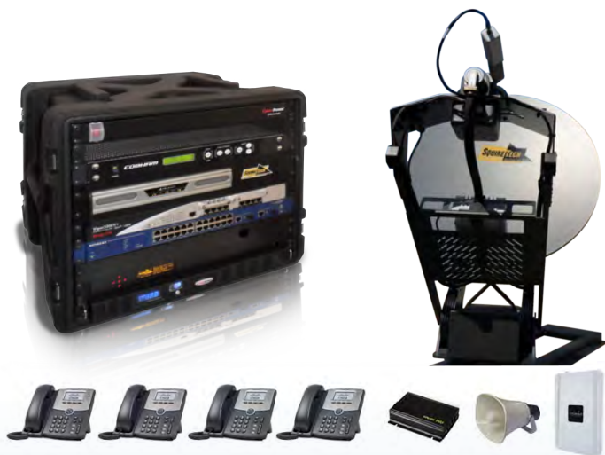
Squire Tech Solutions MR 600 equipment shown above.

Equipment Packages and Service Plans offer low satellite latency, high quality audio and video for live mobile response applications. Our small antennas fit easily on pCom® Response Trailer, Command Center, SUV or can easily be added to an existing trailer or vehicle. Automated hardware operation and bandwidth access free up valuable time to focus on other vital response tasks.