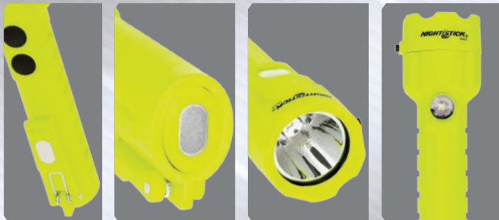
Built in pocket/belt clip with integrated magnet