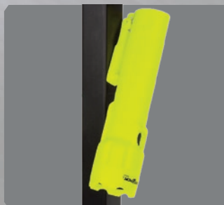
Hands-free magnet in pocket clip