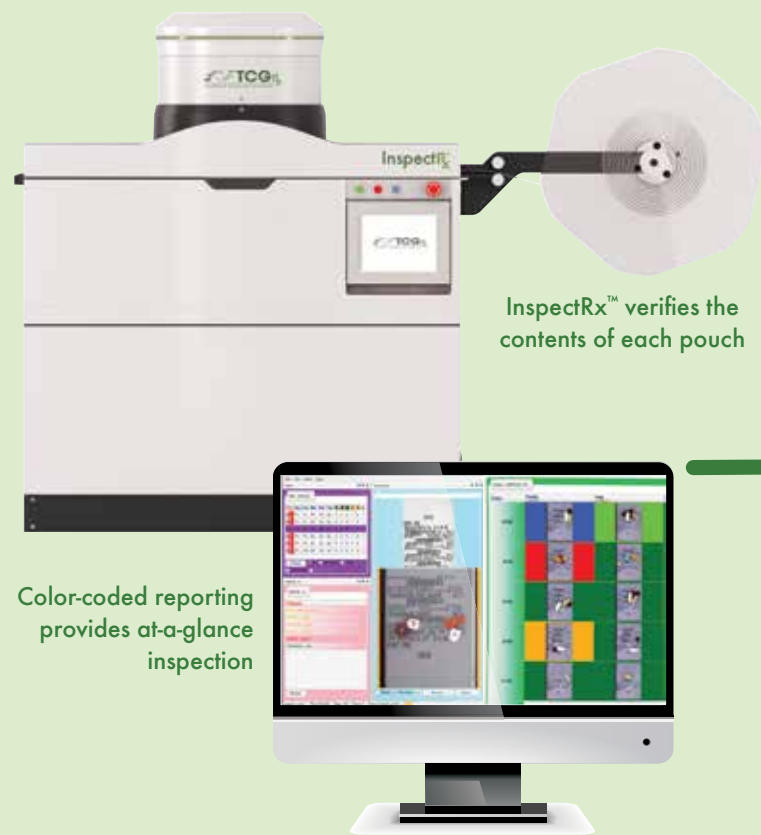
InspectRx™ verifies the contents of each pouch

Your entire pharmacy workflow, designed to be more efficient.