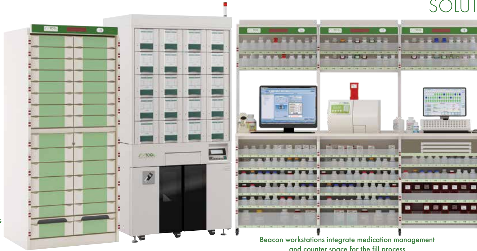
Beacon workstations integrate medication management and counter space for the fill process