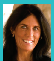
Tieraona Low Dog