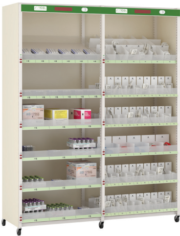
Beacon ® High-Density Fixtures