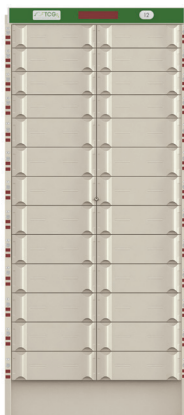
Beacon ® High-Density Drawers