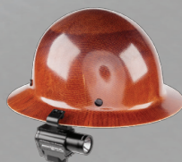
Rear-facing Green safety LED