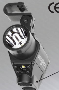
Dual Buttons Control all Light Functions