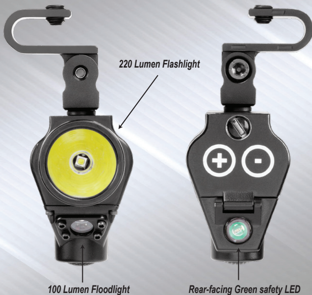
100 Lumen Floodlight