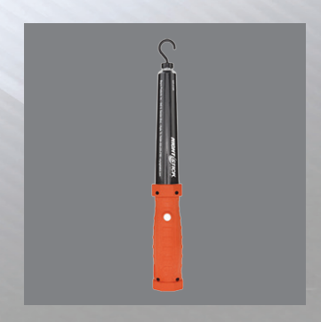
Magnet on body with removable hook