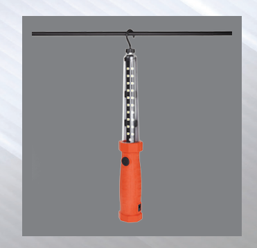
Magnet on top with removable hook