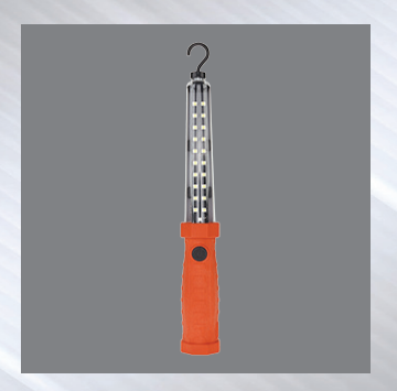
20 LED Floodlight