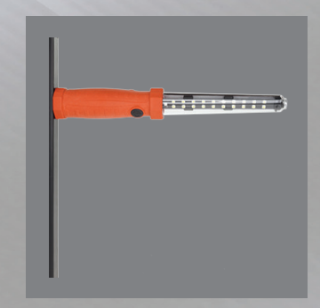
Magnet on bottom