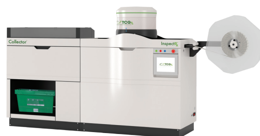
InspectRx™/Collector™ Pouch Verification & Collation System