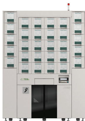
ATP® 2 Automated Tablet Packager