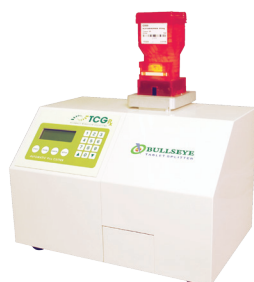
BullsEye® Tablet Splitter