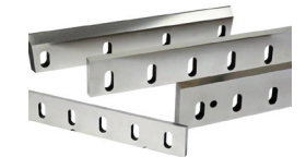
Planner, chipper, counter, paper and plastic knives