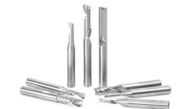
Solid carbide router bits