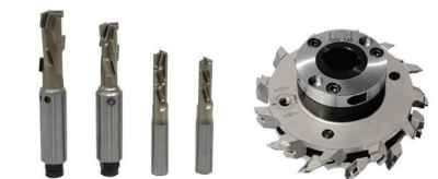
PCD tipped tooling - saw blades, router bits and cutters