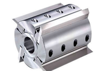
Carbide tipped and steel knife moulder heads