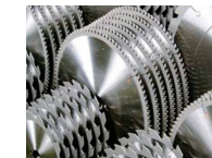
Carbide tipped saws