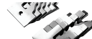
Profiled insert heads and replacement insert knives